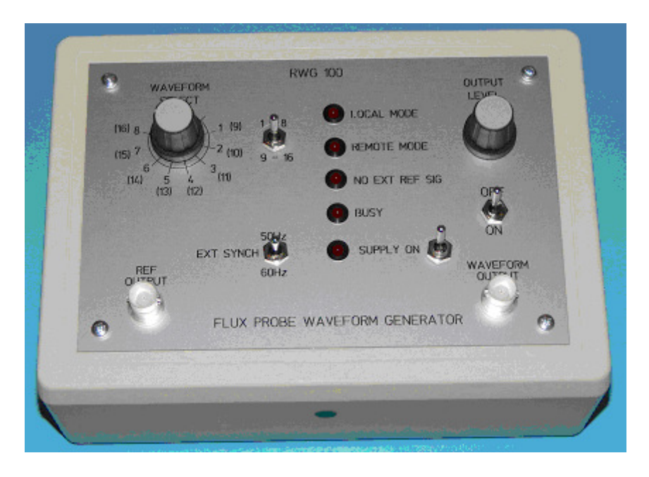
The RWG100 rotor flux probe waveform simulator

The Rowtest RWG100 is a custom signal generator which generates a range of waveforms typical of those obtained from the magnetic flux probes installed in many large 2-pole electricity generators. The signals from these probes are used to check rotor windings for shorted turns.